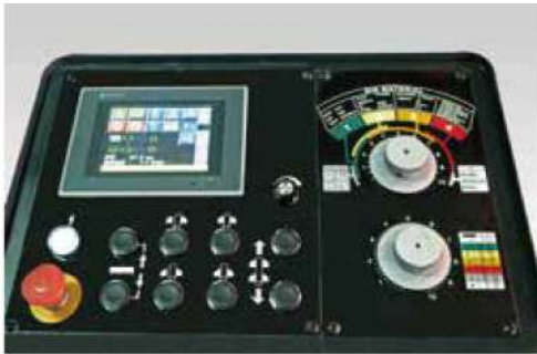
Easy to use control panel

The COSEN C-420NC, part of the Smart SNC-100 series, allows you to get all the benefits of digital control at a very low cost. The C-420NC can memorize up to 100 different jobs, which can all be of different length and quantity. It can compensate for the loss of thickness of your sawing material, completely eliminating the need for manual measuring. Other features of this machine are the automatic shutdown mode, an HMI display that shows the speed of your sawblade and life expectancy. The build-in error feedback system indicates when there is a problem. Whether it is cutting or in overhaul, it is easy to operate. Widely used in the cutting of round materials, round bars, round tubes, square tubes and various other materials, the COSEN SNC-100 series is the best way to pursue high productivity!