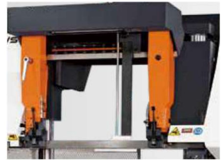
Robust double columns